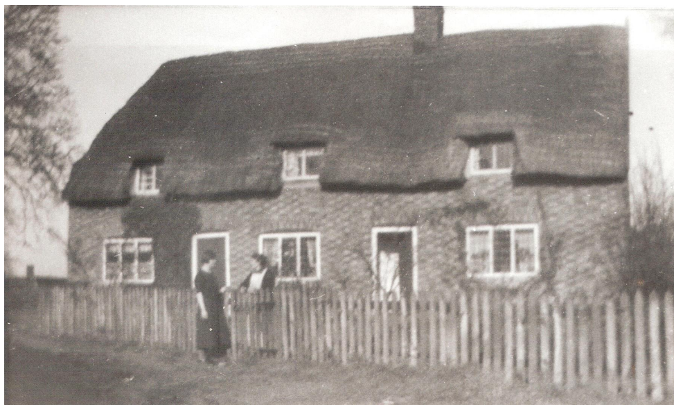
Well House (viewed from Church Walk, c1925)